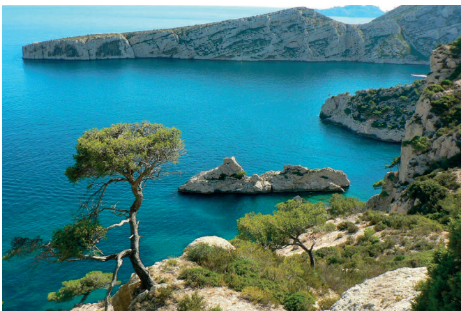
Picture of a 'calanque' near Marseille.