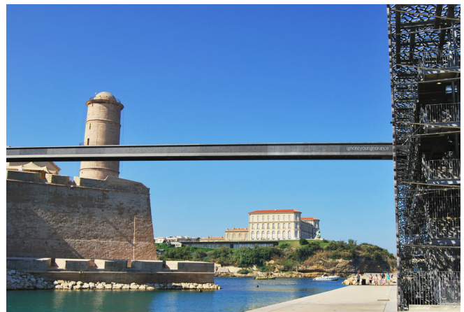
Palais du Pharo seen from the Museum of the Mediterranean cultures (MUCEM).