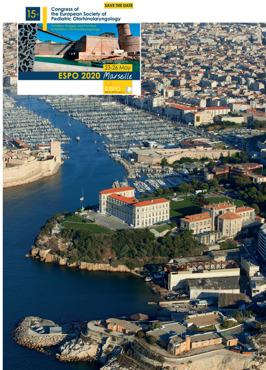
Aerial view of the Palais du Pharo and Marseilles' downtown.