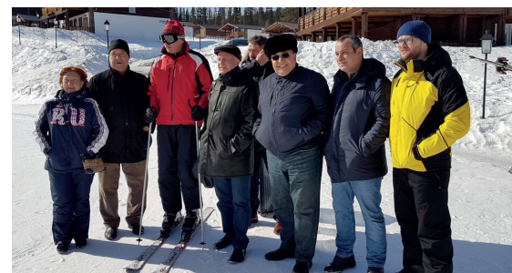
Group picture at a ski resort near Krasnoyarsk, Siberia 2017.