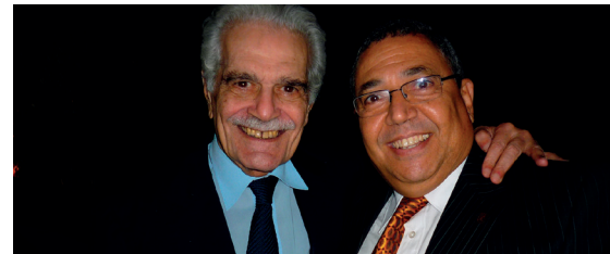
With world-famous actor, Omar Sharif, in Cairo.