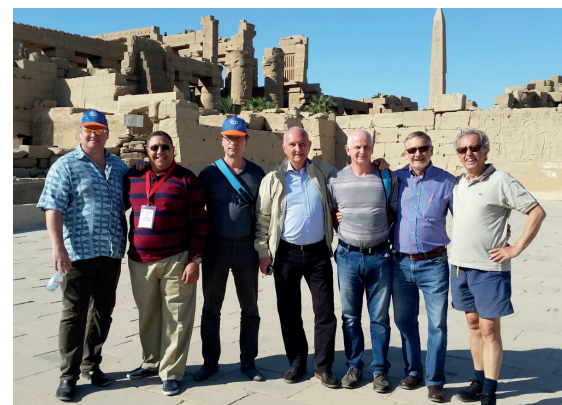
Guests at the Karnak temple, Luxor in Cairo. ORL Congress 2015.

Besides your routine work, always try to allow some time for research. Also attend and share in international meetings for fruitful contact with colleagues around the world.