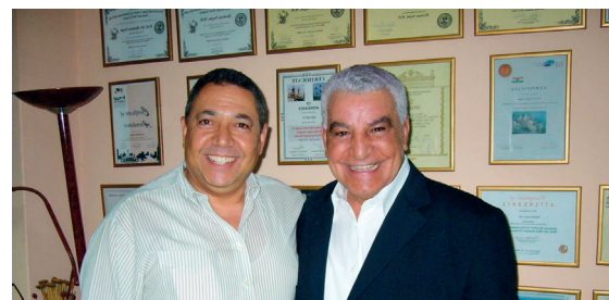
With the world-famous archaeologist, Zahi Hawas.