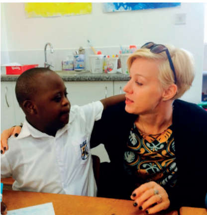
School for children with complex needs Tanzania, Harare.