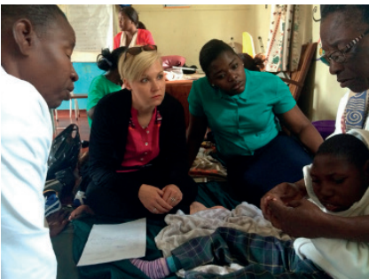
Children with complex needs at a hospital in Tanzania.