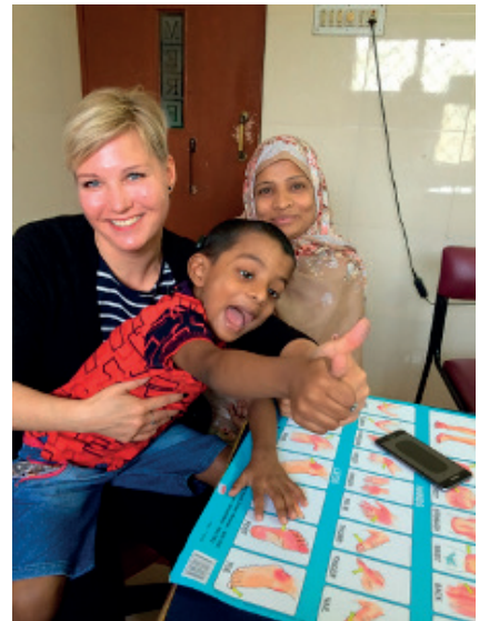
CI users from Chennai, India, after their therapy session.