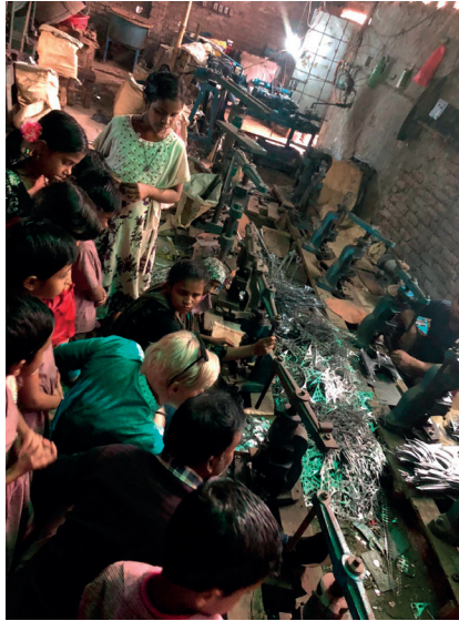
Children factories and the evening schools, Dhaka.