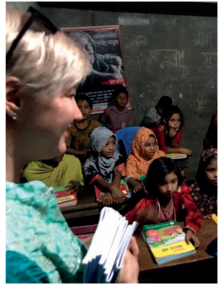
Evening school for factory-working children, Dhaka.