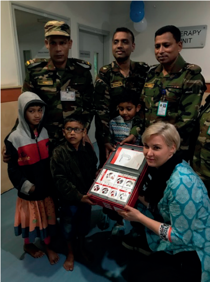
The CI team from Military Hospital Dhaka, Bangladesh, and their patients.