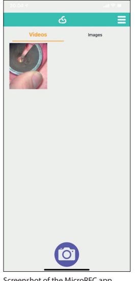
Screenshot of the MicroREC app showing existing saved videos. Clicking the camera button immediately starts recording video.

There are some drawbacks to this device, namely that different attachments must