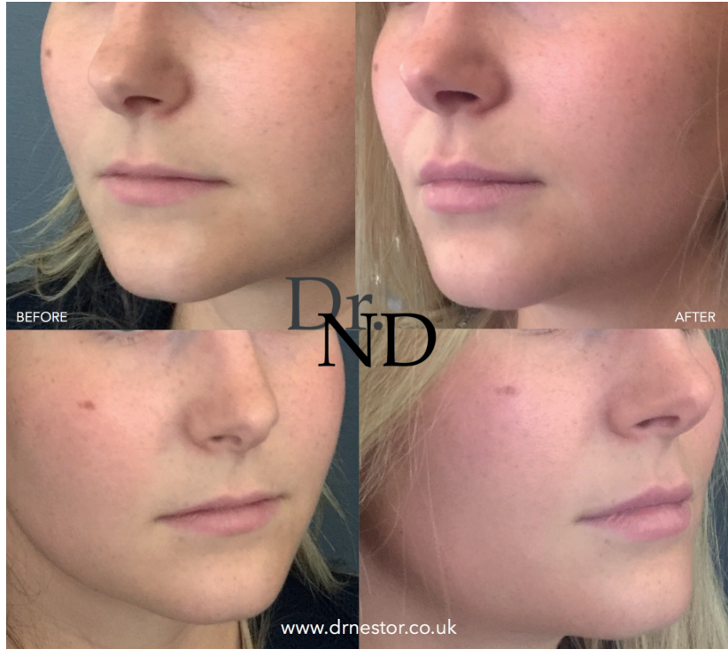
Before and after photos of a patient treated with 1ml of Juvederm® Volift®.

“With celebrity endorsement and many media fuelled horror stories, it is paramount that aesthetic practitioners develop their skill and knowledge in this procedure”