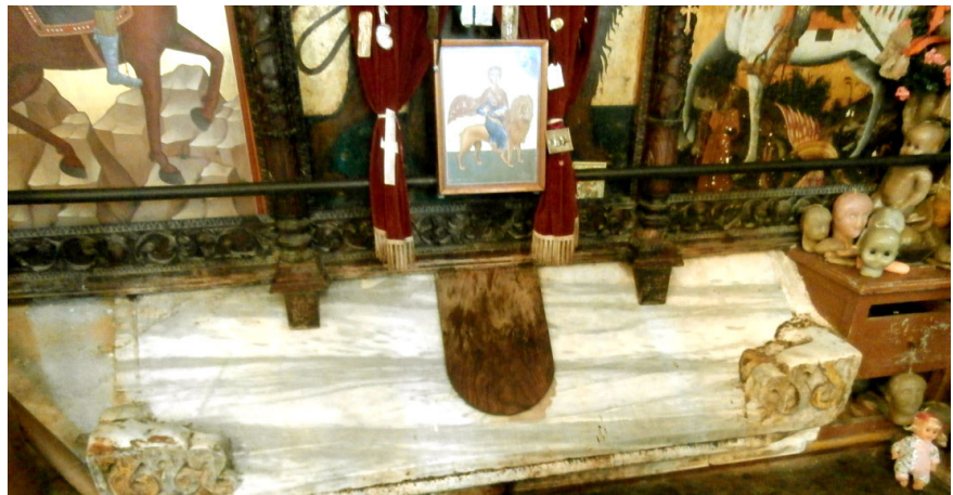
Figure 1. Tomb of St Mamas in Guzelyurt, North Cyprus. Notice the wooden lid covering the holes containing the therapeutic 'balsam' which cures ear disease.

“The duke was so impressed that he decided to exempt him from paying taxes for the rest of his life, since which time Mamas has also been the patron saint of tax avoiders”