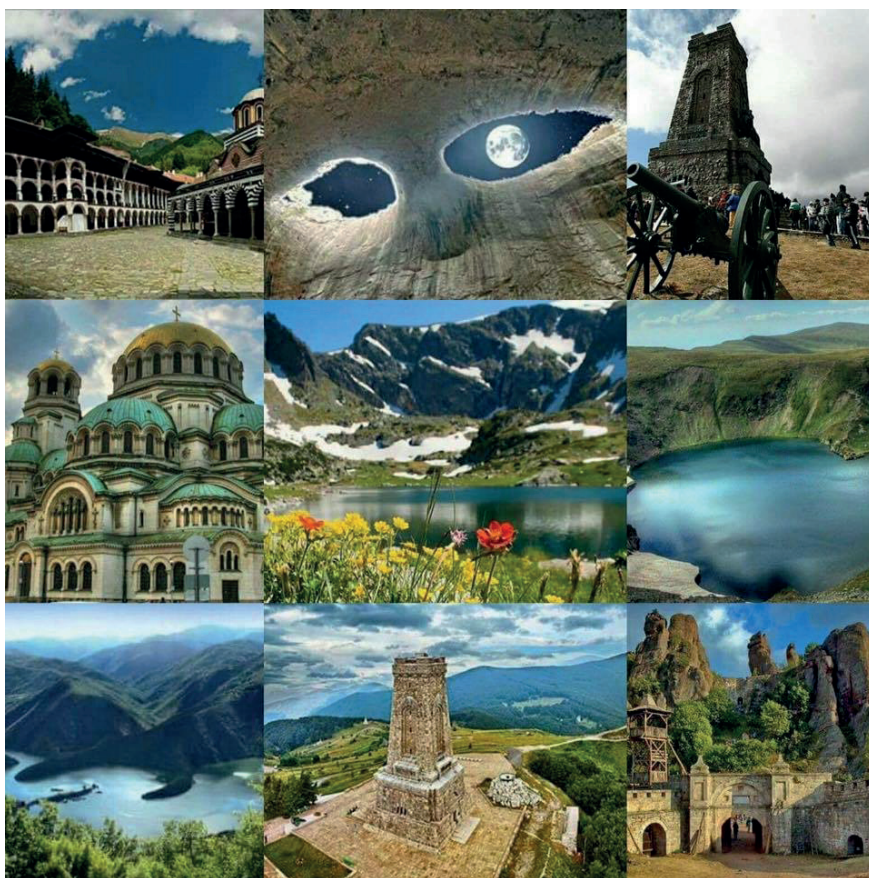
Some of the beautiful sights Bulgaria has to offer: (Top L-R) the Rila Monastery, Prohodna Cave, the Shipka Monument; (Bottom L-R) the Patriarchal Cathedral of St Alexander Nevski, the Seven Rila Lakes, and Belogradchik Rocks.

The capital of the Republic of Bulgaria is a unique city that grows but does not get old and has more than 8000 years of history ( www.en.wikivoyage.org ). Established around a hot mineral spring, at the crossroads of extremely important roads linking Western Europe with Asia Minor, and the Middle East and the Baltic Sea with the Aegean Sea, the city of Sofia has seen and remembers a lot. It is a millennial perseverance, which very few European cities can be proud of. In downtown, Sofia stands the oldest operating church in