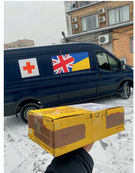
The box of hearing aids arriving in Kyiv.

To hear about the ways in which HAR is transforming lives, scan these QR codes: