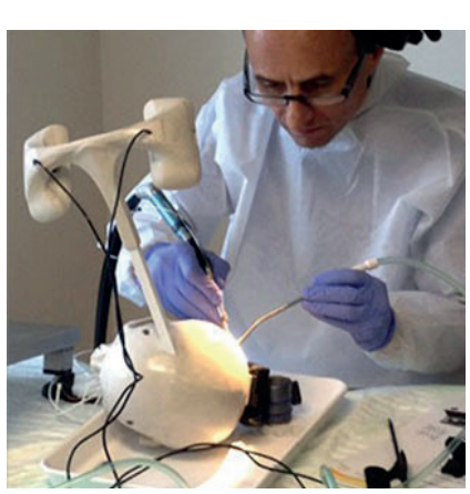
Figure 3. 3D printed temporal bone (Phacon)

Figure 2. Voxelman temporal bone simulator.