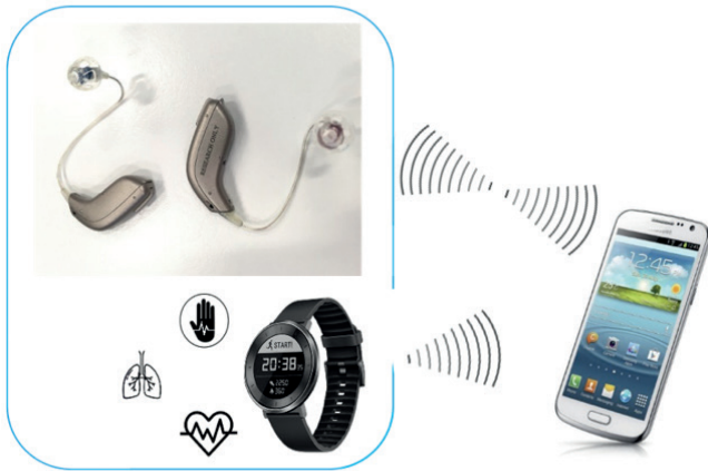
Figure 2. Components of the EVOTION platform and clinical study.